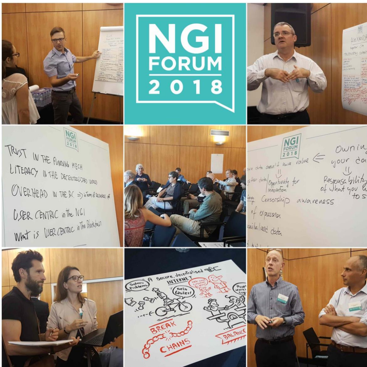
Figure 1: Shots from the “Better search for trustworthy content and objects discovery” interactive session at NGI Forum 2018

A brief report of the third session at NGIForum18: “Better search for trustworthy content and objects discovery” by SpeakNGI.eu. Porto 13th September 2018